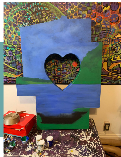
Atwood Lake sculpture progress, photo provided by artist Nate Travis